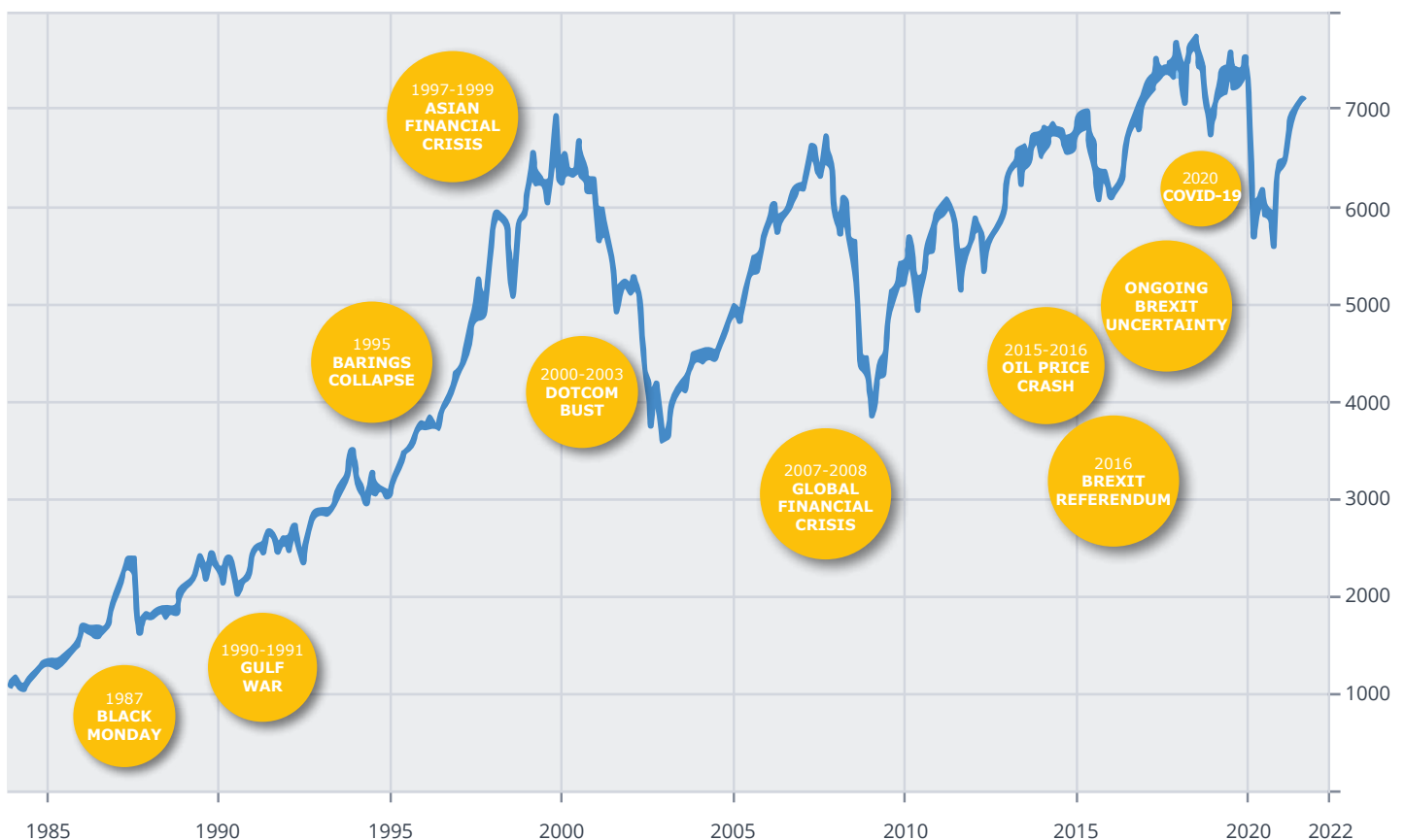
Chart: FTSE 100 since inception to 1 September 2021

The value of investments can go down as well as up and you may not get back the full amount you invested. The past is not a guide to future performance and past performance may not necessarily be repeated.